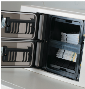
Large Strip Storage Boxes (strip feeders)

AUTION Sticks (10EA & 10PA) can be loaded. When the two feeder-boxes are filled with the strips, continuous measurement of up to 400 tests can be made.