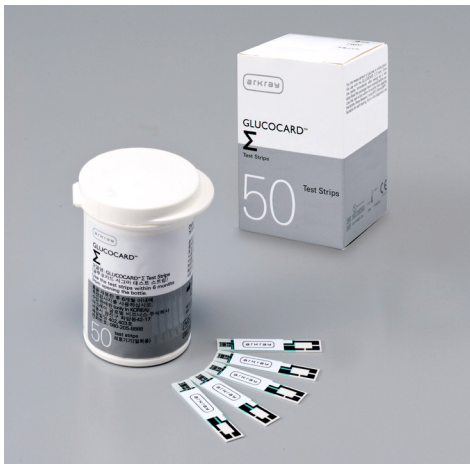
Test strip for GLUCOCARD \Sigma