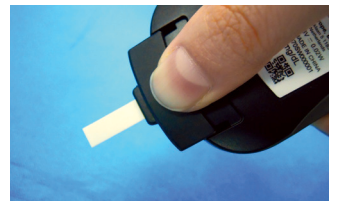
Test strip disposal lever

The meter has a test strip disposal lever which helps keep your hand clean and helps avoid contact with blood.