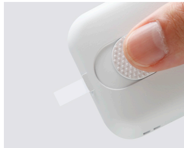
Test strip disposal lever