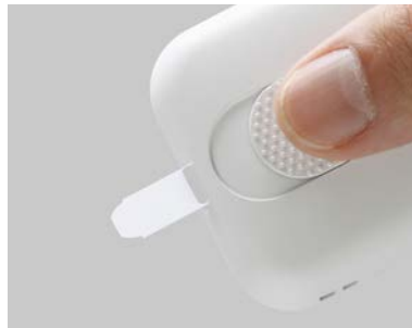
Test strip disposal lever